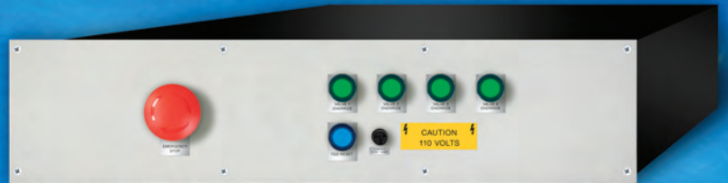
GMSS-4 — engineered for our Four Cylinder Cabinet