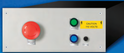
GMSS-2 — engineered for our Two Cylinder Cabinet